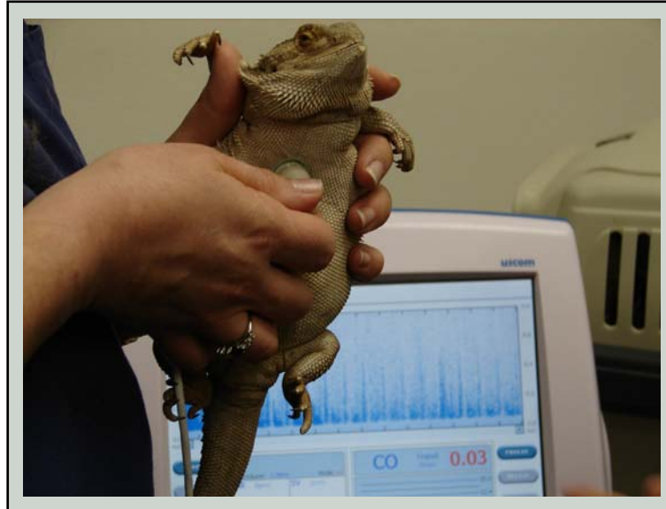
Figure 2. Bearded Dragon comfortable and at rest during a non-invasive USCOM examination via the parasternal acoustic access.