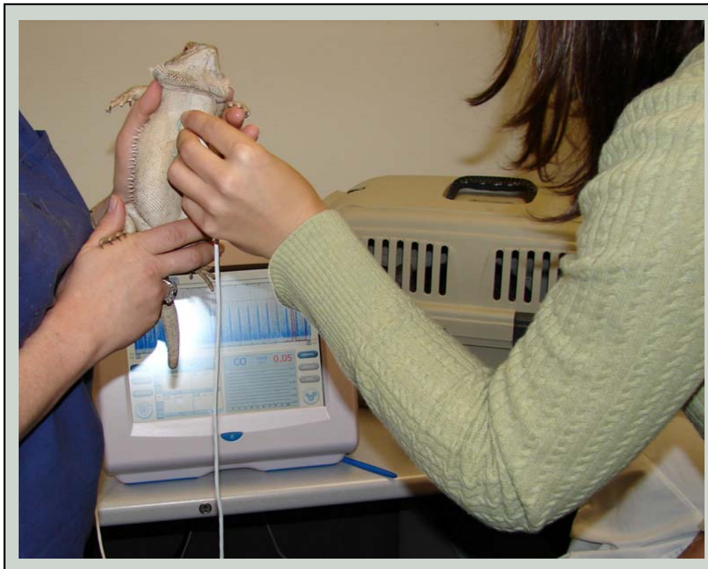
Figure 1. Bearded Dragon undergoing USCOM examination during support in the erect position.

acquired and measured using the conventional ultrasound method while the USCOM algorithm was applied for calculation of flow volume. Flow profiles are demonstrated in figures 3 and 4. Cardiac Output (CO), stroke volume (SV), and heart rate (HR) were measured and values indexed to the mass of the reptiles for comparison. The lizards were returned to their pen after examination and were without obvious distress. Observations were made at 30.6°N of the Equator, at a temperature of 18°, on the 27th Julian day, at 15hrs past midnight.